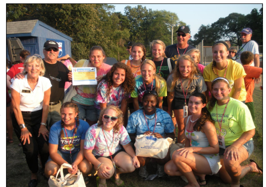
Meet the South Bend Team!

town government for also participating. By the way, our girls were in the quarter finals. The WORLD CHAMPIONSHIP team this year was our own Laurel, the host team.